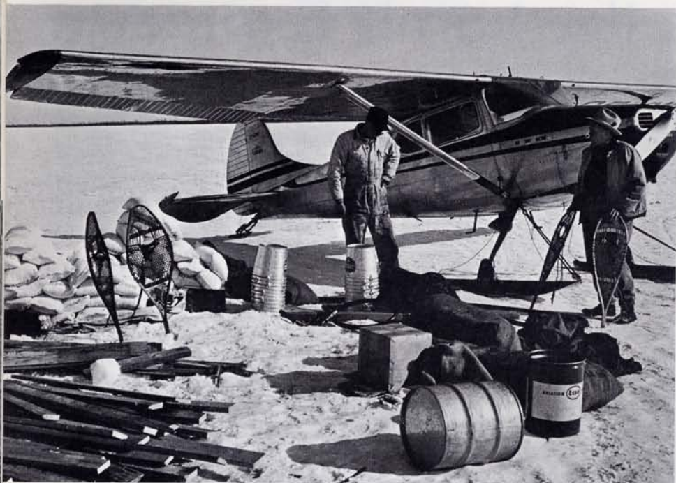
The air line will fly almost anything into the north—anything that a northerner can use