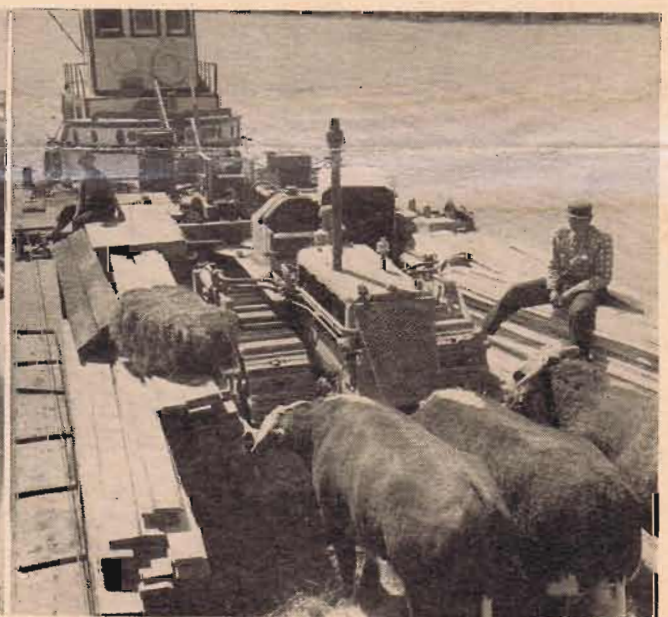
Lamb's diesel cruiser pushes an open barge down the Saskatchewan to the 7 Bar L Ranch at Moose Creek. Barge is loaded with three Hereford bulls, lumber, tractor, groceries.